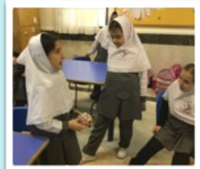
pass the question ball

In this unit we explored addition and subtraction on a hundred chart and finding the missing numbers. We practiced regrouping ( trading) in addition and subtraction. Moreover, we learned how to subtract with two regroupings and across zero. We learned about column addition and mental maths. Also we tried to solve problems by guessing and checking. We did our best to solve multi-steps problems.