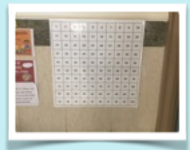
hundred chart in class